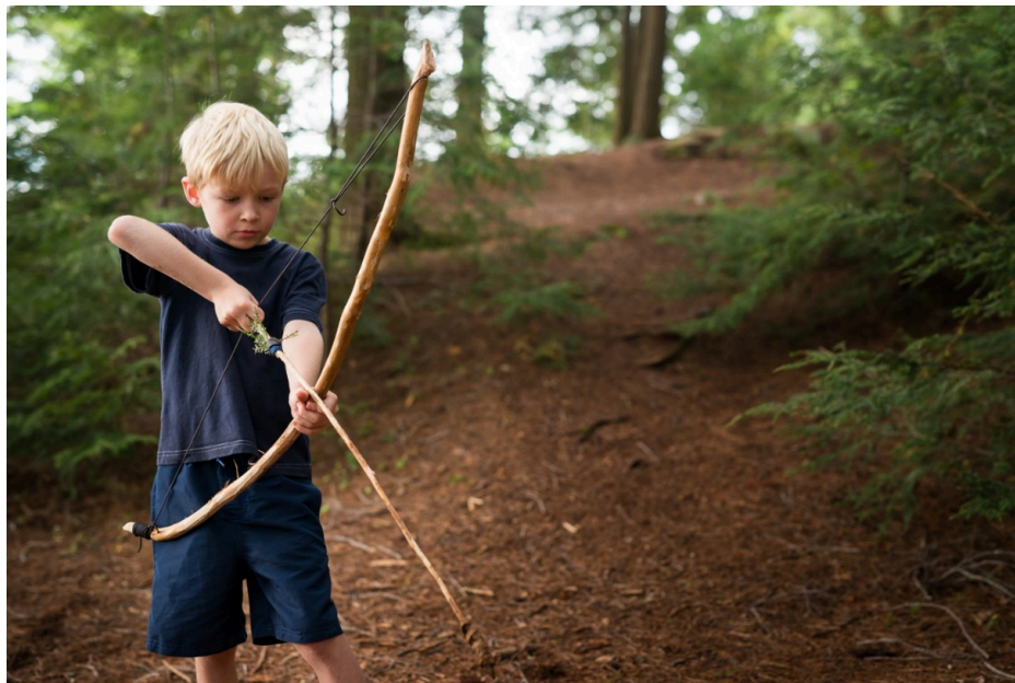
Assessing risk is an important part of children's play and engagement in the outdoors.

injuries. As the statistics in the next section will illustrate, injuries occur more frequently at home and often indoors or as a result of a motor vehicle accident than due to outdoor risky play.