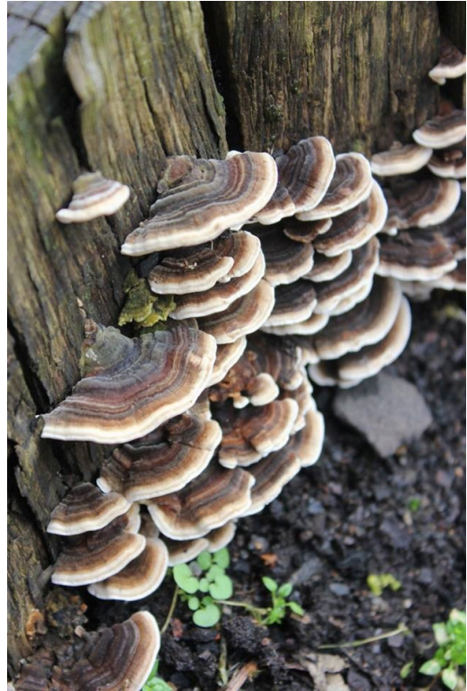
Children's engagement with land and place include knowledge of local flora and fauna

A parent friendly article outlining the importance of nature in everyday life. In addition to the identified article, the website provides a variety of resources for educators. Nature Play lesson plans, from Infants to 6th grade are available under the "Education" tab.