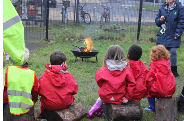
Snack cooked over a campfire creates a sense of community

This empirical research study shows how a curriculum based outdoor learning program for primary school children improves children's learning. The study compares attainment data in English reading, English writing and maths to conclude that children in the Wilderness Schooling group significantly improved their attainment in all three subjects.