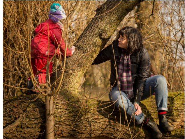
Nature provides many opportunities for interactions with peers and adults

This paper addresses the issues related to the outdoor learning environment and the barriers that educators face. This article encourages educators to view outdoor learning as a pedagogical and problem-solving learning experience.