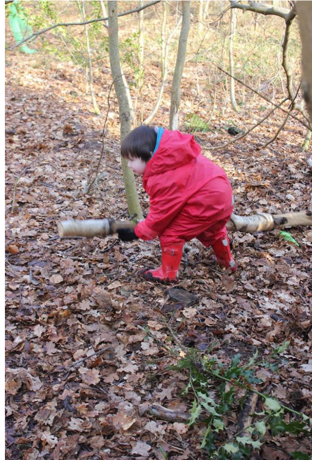
Physical development, including strength and locomotor skills, is enhanced through interactions with natural challenges

This 46 page .PDF Toolkit is designed to focus on engaging school-age children in more activity that is playful within their school day. It includes a program that can be used to support children to become leaders of play. The benefits of play and physical activity are also included.