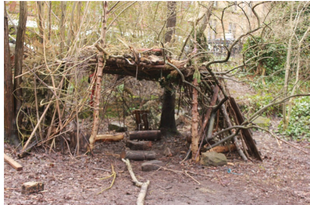
Natural forts provide a sense of being alone.

People have a real connection with the woodlands around them. Learning outdoors is important for children and young people. The natural environment should be seen as an extension of the classroom. Children can improve their confidence, motivation, concentration, language and communication, and physical skills through experiences in nature.