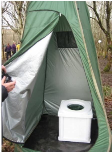
Portable shelters provide privacy.

https://ecampusontario.pressbooks.pub/outdoorplay/?p=37