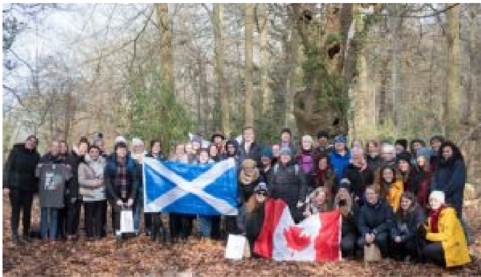
Canada-Scotland Outdoor Play Study Tour