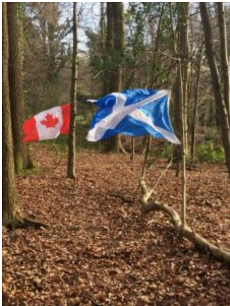
Flags act as a trail marker to a wooded classroom

Educators play an important role in promoting children's well-being by creating, fostering, and sustaining a learning environment that is healthy, caring, safe, inclusive, and accepting.