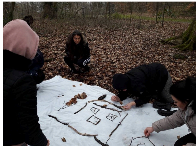
Transient art encourages group collaboration