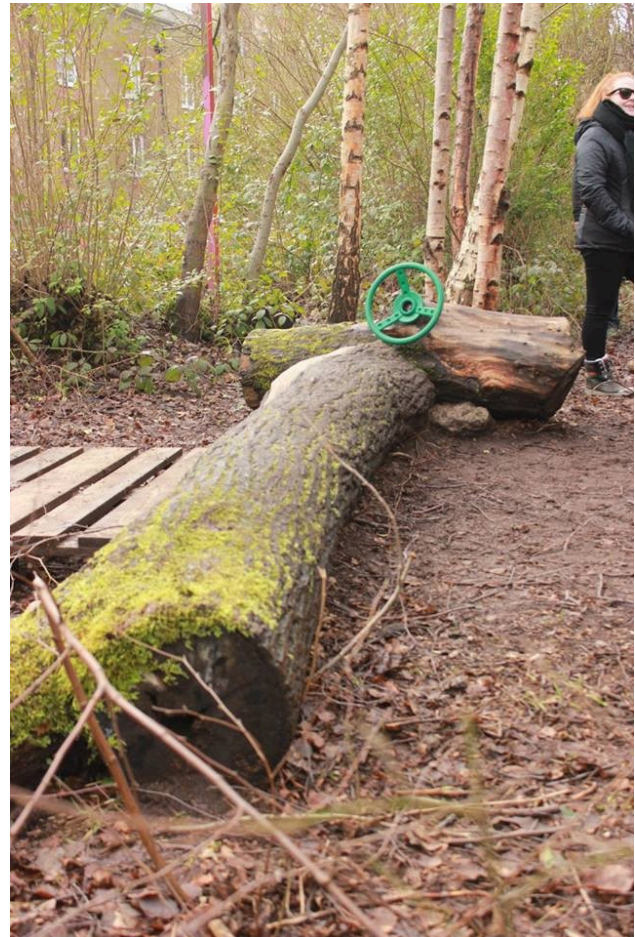
All children can use simple materials in many imaginative ways.

This journal article discusses how children and adults can provide opportunities to engage in manageable risky play. Discussion identifies ways to change how parents and educators view risk taking and encourage children with disability to take responsibilities for their own actions in outdoor play.