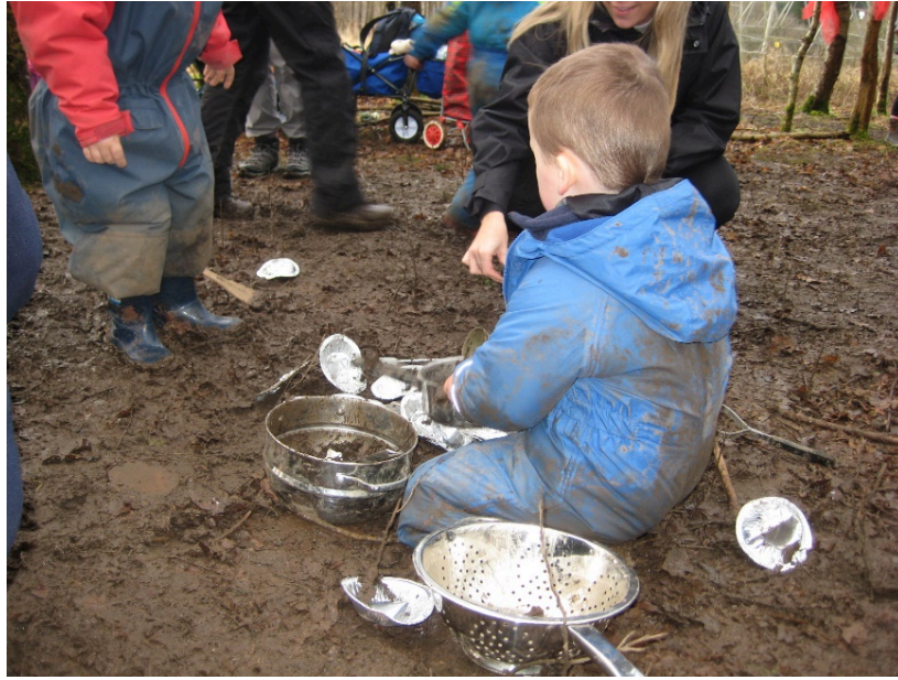
Mud kitchens are a staple of outdoor play.