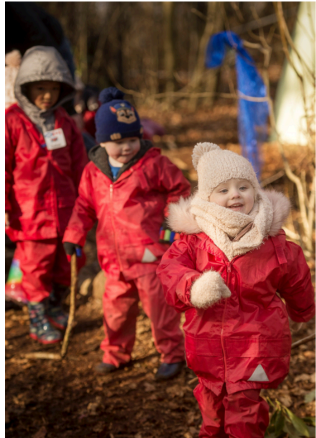
Leadership and social negotiation are a few of the skills enhanced through outdoor play

Through an analysis of two empirical examples, the authors argue that curious play offers a comprehensive and existential approach to understanding the interplay of children playing in nature and children's growth. The authors argue