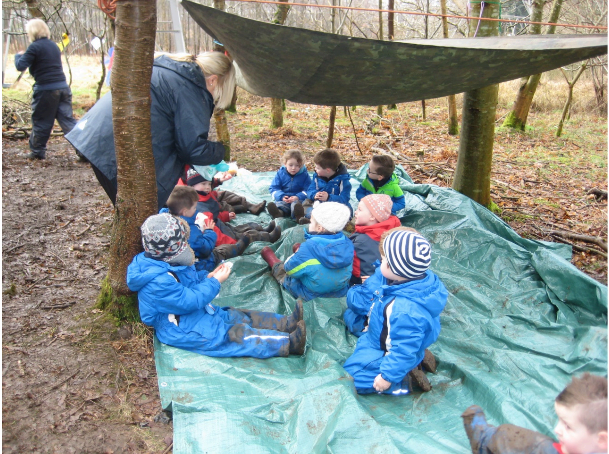
Tarps provide a location for group gatherings and provide shelter from the rain or sun.