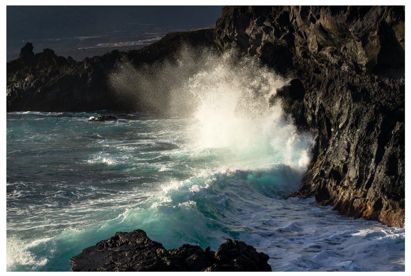
Image: Robin Frkovic, photo of crashing waves. London: Personal Photo. <u>CC BY-NC-SA 4.0</u>.