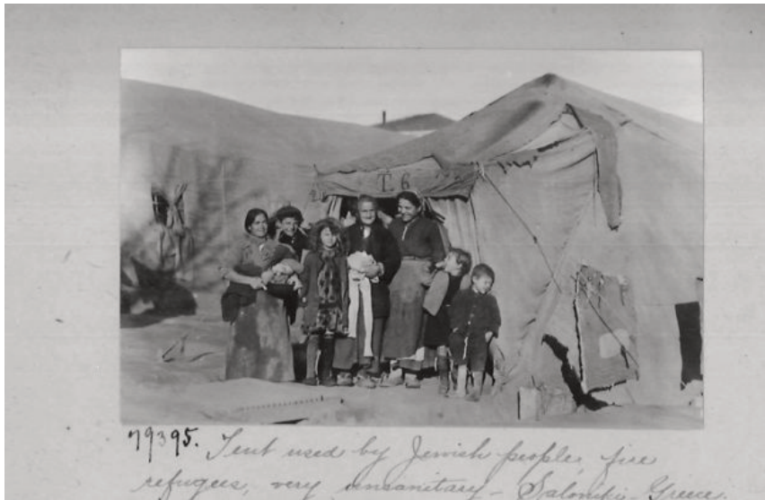
Image 2 "Tent used by Jewish people, fire refugees, very unsanitary. Salonika, Greece." Lewis Hine, 1919. (GCAH-79375)