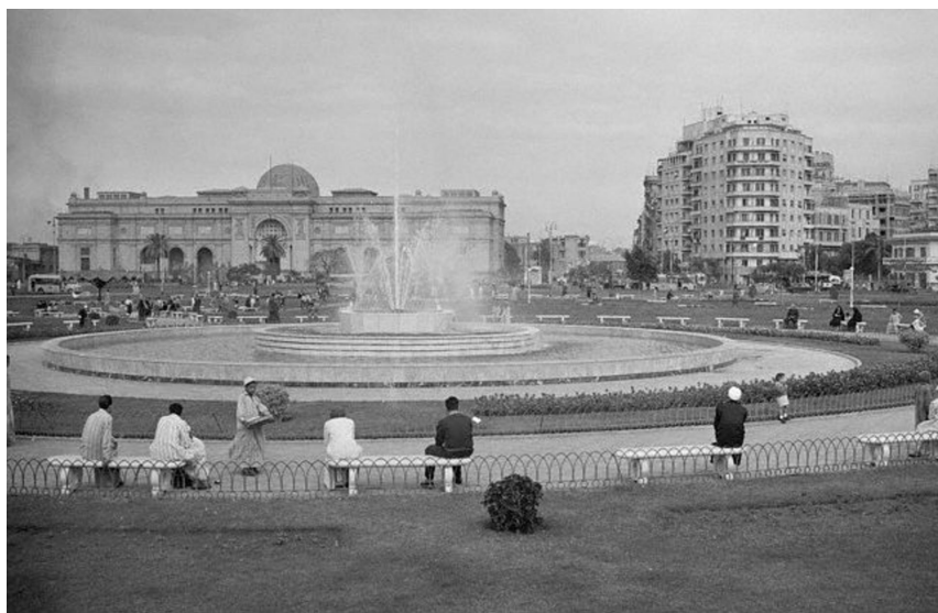
Cairo's Tahrir Square, mid-1900s.

the expectations of those wishing to emigrate have all changed in the past sixty years.