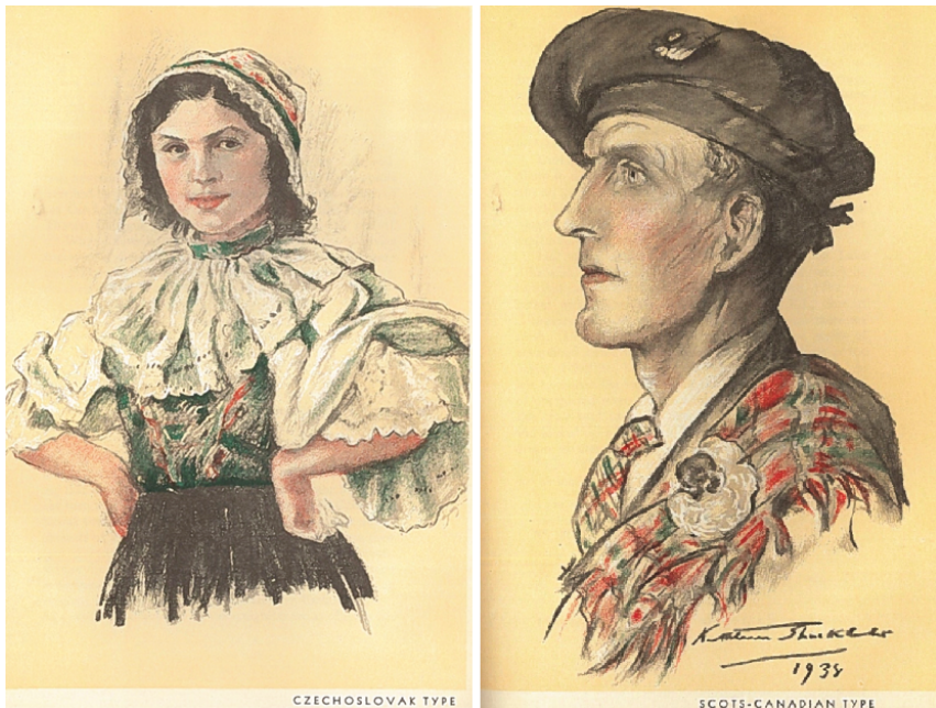
John Murray Gibbon, Canadian Mosaic (1938).

In order to create this ideal Canadian, Gibbon praised only very specific ethnic traits and traditions, ones that he believed would fit into his definition of Canadian national identity. This can be seen most clearly not in what he included in Canadian Mosaic , but rather what he did not. He discussed a large number of “racial groups”, but every single one hailed from Europe. Asian immigrants, Aboriginal peoples, and people of African descent were completely absent from Gibbon’s definition of belonging in the northern nation.