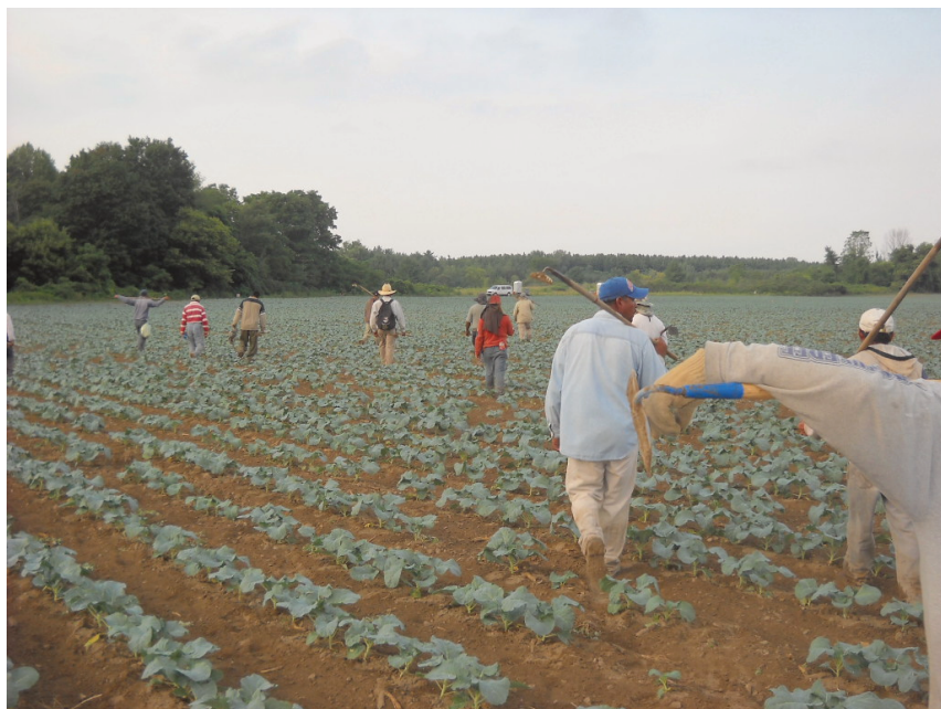
Returning to the vans at the end of the day, August 2010.

bunkhouse. The farmer had it timed so that we would depart exactly 45 minutes before sunrise, driving through the dark in order to arrive right as the sun's first light streamed across the field, allowing for maximum production during the daylight hours. Some days we would work until dark before returning to the bunkhouse. Workers often took advantage of the long drives to sneak in a few more minutes of sleep, sometimes leaving the driver as the only person awake in the van. Fortunately, he was not shy about blasting norteña music to keep himself awake, napping coworkers be damned.