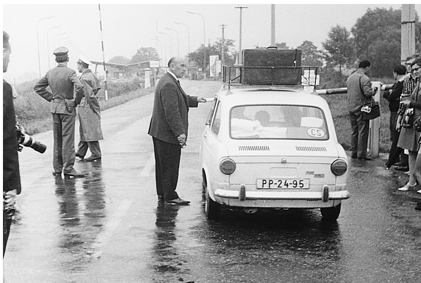
On the outskirts of Bratislava, a family prepares to cross the border into Berg, Austria (August 1968).

democratic values and refused to live under a totalitarian regime. Many resettled in the West in the hopes of liberating their homeland from communism. At the height of the Cold War, when Canadians were overly vigilant against the arrival of undesirable individuals from the Eastern Bloc, federal officials were keen to admit anti-communist Czechs and Slovaks who had fled from the events of 1948. These newcomers were often celebrated by the Canadian public as ‘freedom fighters,’ but also mistrusted as potential communist sympathizers or spies.