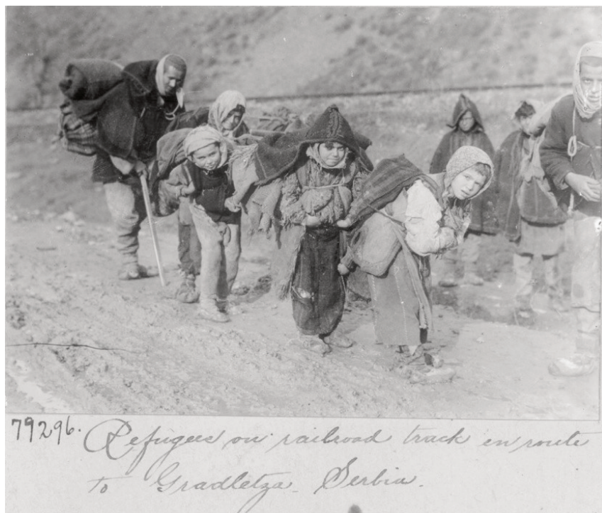
Image 1. "Refugees on railroad track en route to Gradletza, Serbia." Lewis Hine, 1919. (GCAH-79296). (These handwritten captions are in Hine's own hand)

diately following the Great War. The ARC hired Hine because of his reputation as America's foremost photographer of social reform issues. Hine had trained as a sociologist and an educator. He was not a journalist, but rather a social reformer whose main medium of advocacy was the camera. By the mid-1910s, Hine had developed a reputation as "the most extensive and successful photographer of social welfare work in [America]." 2 During the First World War, his positive portrayals of refugees served the ARC well in their development as America's foremost relief agency .