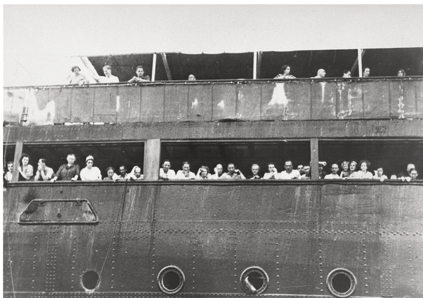
MS St. Louis in Havana, 1938.

In our minds the contradiction is striking and not easily dismissed. How is it that antisemitism can be a quotidian part of life in Canada while the country is also associated with being a place of refuge? How did this fundamental contradiction come to be and what are the implications for the present and future? Part of the answer lies in the ease with which politicians can speak in morally righteous terms when apologizing for historical wrongs and the gulf that often exists between the symbolism of their words, their actions, and the lived experience of those most affected by the subject and substance of their apologies.