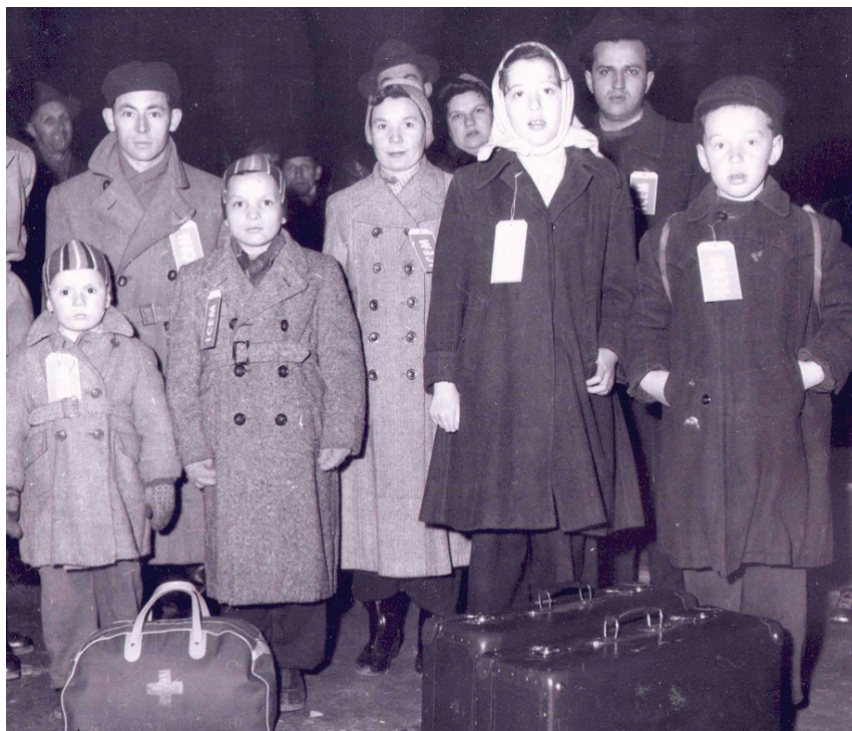
Hungarian Refugees arrive in Canada, 1957.

gary by train and horse-led wagons to come to Canada in April of 1951, but not before spending six years stateless in Austria. They were among the more than 120,000 refugees who made their way to Canada between 1947 and 1953, thanks to contract labour schemes or government, family or church group sponsorships. Make no mistake, the selection criteria were guided by racial and political bias, along with a heavy dose of economic self-interest.