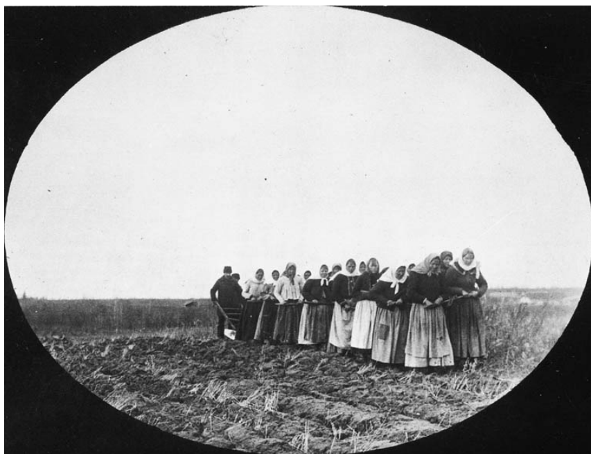
Doukhobor women, Thunder Hill Colony, Manitoba (ca. 1899). Library and Archives Canada, C-000681.

that morally superior angel in the home. Consider too the distinctive dress of the women who completed the portrait of Immigration Minister Clifford Sifton's ideal Eastern European peasant "in a sheepskin coat" with "a stout wife and a half-dozen children" grudgingly welcomed to Canada. Someone needed to do the backbreaking labour to settle what was portrayed as an empty Prairie, the original First Nations inhabitants having been relegated to reserves. Even Icelandic pioneer women, easily assimilated, one might expect, into the Nordic race, were castigated for their typical headdress: a dark knitted skullcap with tassel. Such women may now be considered Old Stock Canadians, but not so long ago, their Anglo neighbours viewed them as second-class. According to historian Sarah Carter, Anglo women's organization in Alberta thought Ukrainian girls so deficient in the standards of proper womanhood that they too should be sent to residential schools.