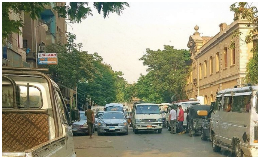
Typical traffic congestion in Cairo, as pedestrians, commuters, and standing traffic vie for space.

of the drivers accepted my claim that I was visiting Cairo from my hometown of Alexandria, where I was born and raised until my family chose to emigrate in my youth. I would then share that I was living in Toronto, Canada and was visiting to collect sources for my research. Every driver, without fail, would then relate how he had a friend or relative in a North American city and plans to emigrate.