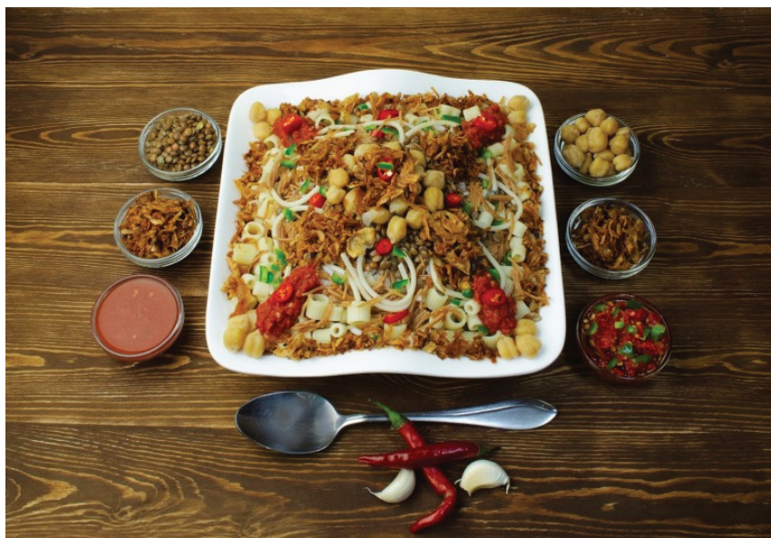
Kushari is made of rice, macaroni, and lentils mixed together, topped with tomato-vinegar sauce, garnished with chickpeas and crispy fried onions and sprinkled with garlic juice and hot sauce.

kitchens and mosque and church festivals. This dish, central to my own memories of 'home', remains confined to the familial private sphere and community cultural festivals.