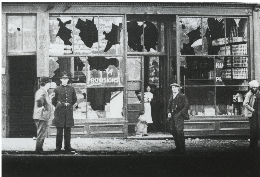
Building damaged during Vancouver riot of 1907 – 130 Powell Street. UBC Archives, JCPC_36_017.

On Saturday 7 September 1907, Vancouver was gripped by one of the largest race riots in Canadian history. This event started with a large gathering of people who also marched on City Hall, in that case behind a banner that said: “Stand for a White Canada.” 1 After listening to fiery speeches against Asian immigration, a significant number then headed to Chinese and Japanese neighbourhoods in the city, where they wreaked extensive property damage, physical violence, and terror.