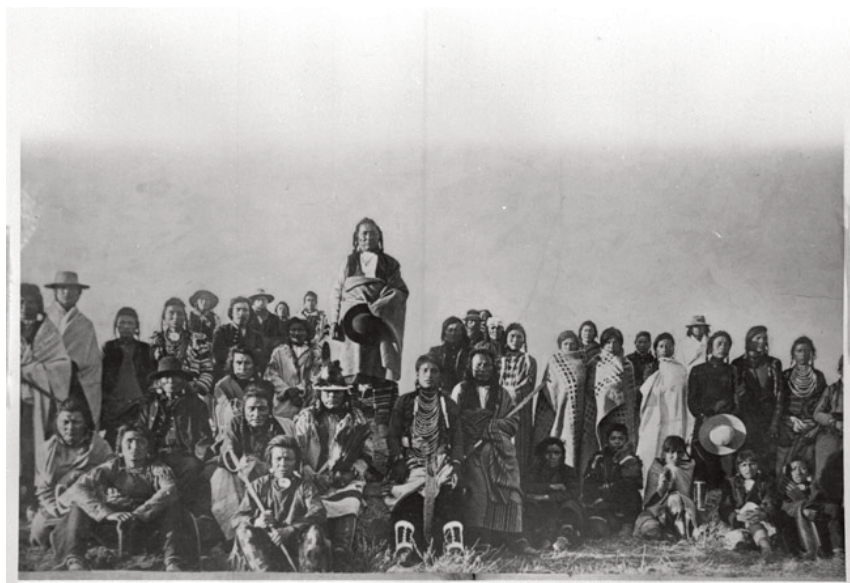
Little Bear's Band as they await deportation to Canada in 1896.

considered historically, are involved on both sides of the equation. The exodus of the Cree after the 1885 Rebellion offers a Canadian example. The Cree's experience serves not only as a reminder of our uncomfortable past, but also reveals some of the limitations in the model we continue to use to conceive of refugees and our obligations to them.