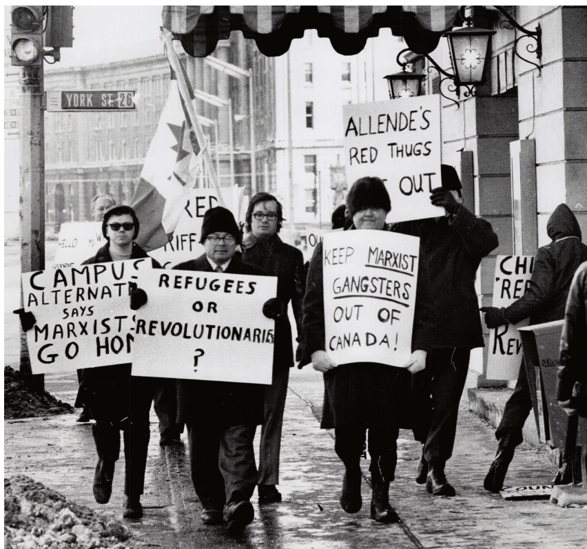
Protest against Chilean refugees, Toronto.

By mid-1979, nearly 1.5 million refugees had fled their homes in Southeast Asia. In June of 1979, the Canadian government announced that 60,000 Indochinese refugees would be resettled by the end of 1980. Thousands of Canadians came forward to welcome refugees, giving a dramatic launch to the new Private Sponsorship of Refugees Program. Popular pressure forced the government to adjust upwards its initial commitment to resettling the refugees. For the years 1978-81, refugees made up 25% of all immigrants to Canada.