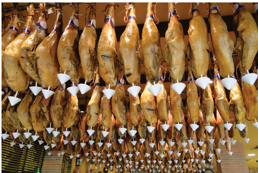
Ceiling display of Jamon Serrano and Jamon Iberico, Granada, Spain.