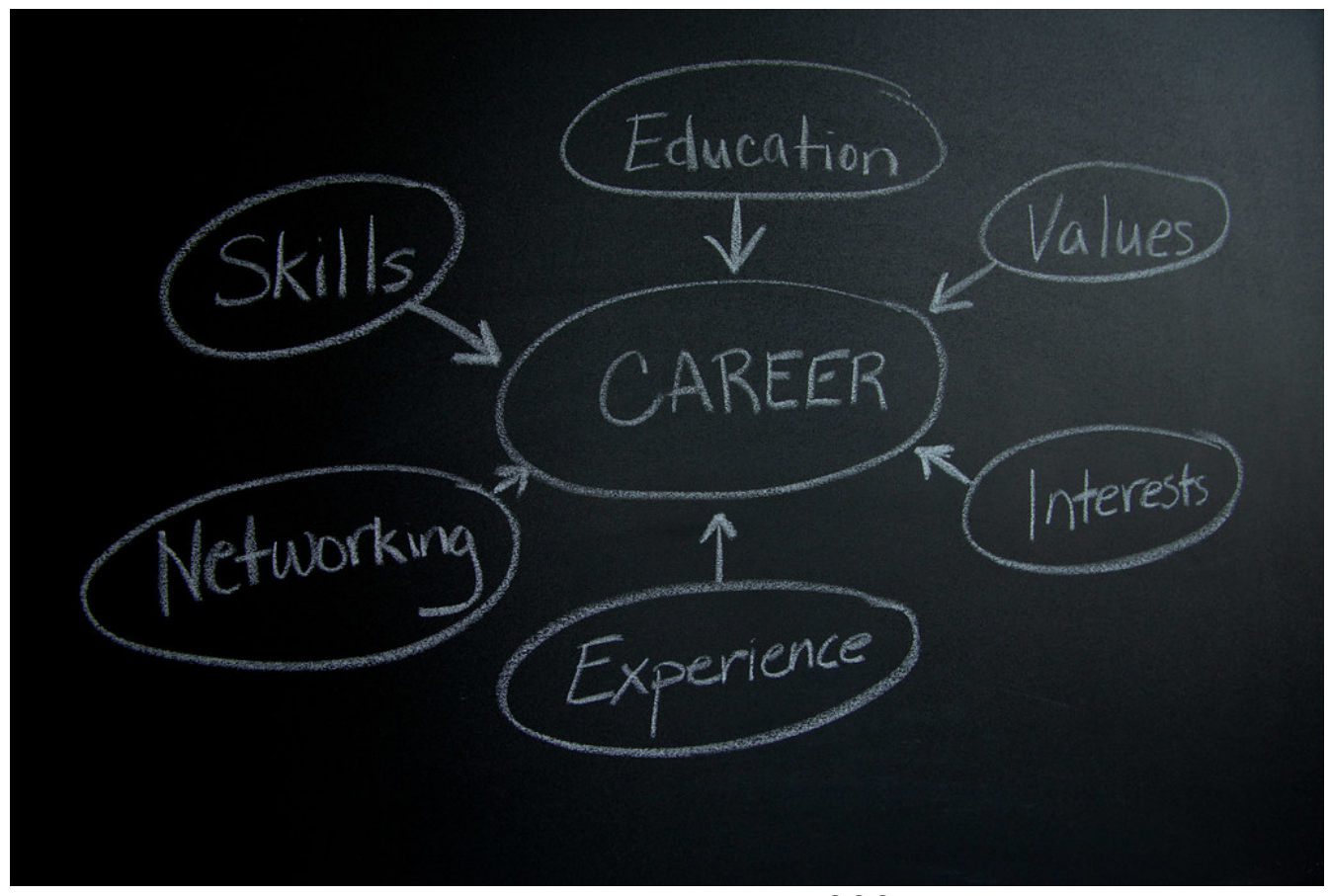
"Career-Mind-map-Chalk" by flazingo_photos is licensed under CC BY-SA 2.0 O .