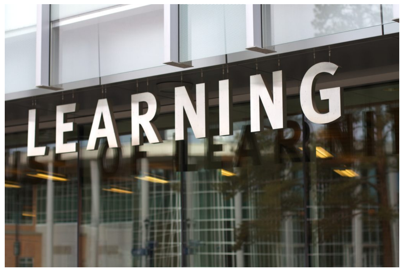
"Learning is Hanging Out"

Completing a degree or diploma is not the end of our learning journey. Striving for continuous personal improvement and staying motivated to learn new skills and talents can help us in preparing for the unknown and the rate of change at which our world is changing.