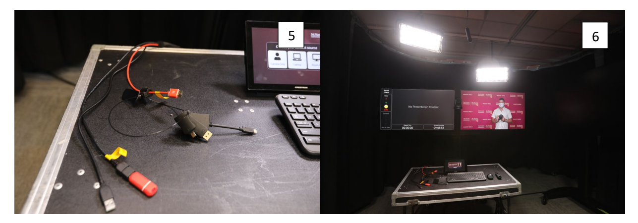
Photo 5 includes a user laptop connection (HDMI), available adapters, a USB connection for connecting to the presentation clicker available (optional) and USB input for recording media

Photo 6 provides an example of what the presenter will see through the presentation monitor (left), and the preview monitor (right).