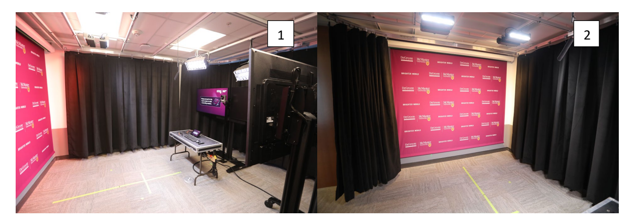
Photo 1 and 2 show the studio with the McMaster/DeGroote branded backdrop. Markings on the floor indicate where the user should stand when presenting (behind the T-line).