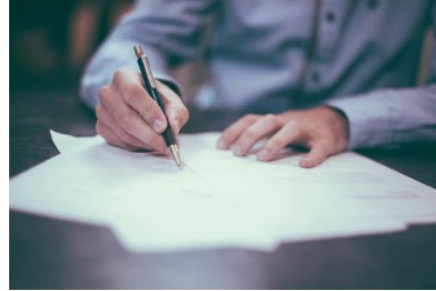
WSIB & HSPnet Consents

Under WSIB and HSPnet Consents, you are only required to complete the WSIB Consent.