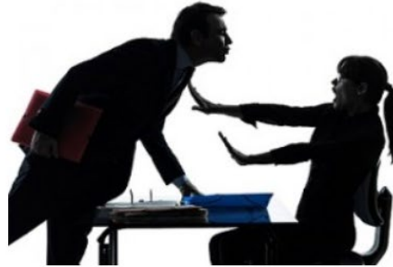
WORKPLACE HARASSMENT AND WORKPLACE VIOLENCE