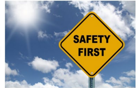
Worker Health and Safety Awareness