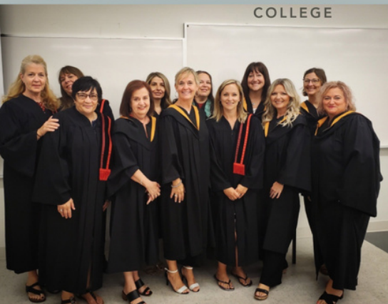
Convocation June 2022