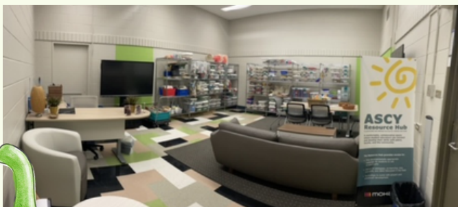
ASCY Student Resource Hub, Mohawk College

We wish you all a Happy ECE Appreciation Day!